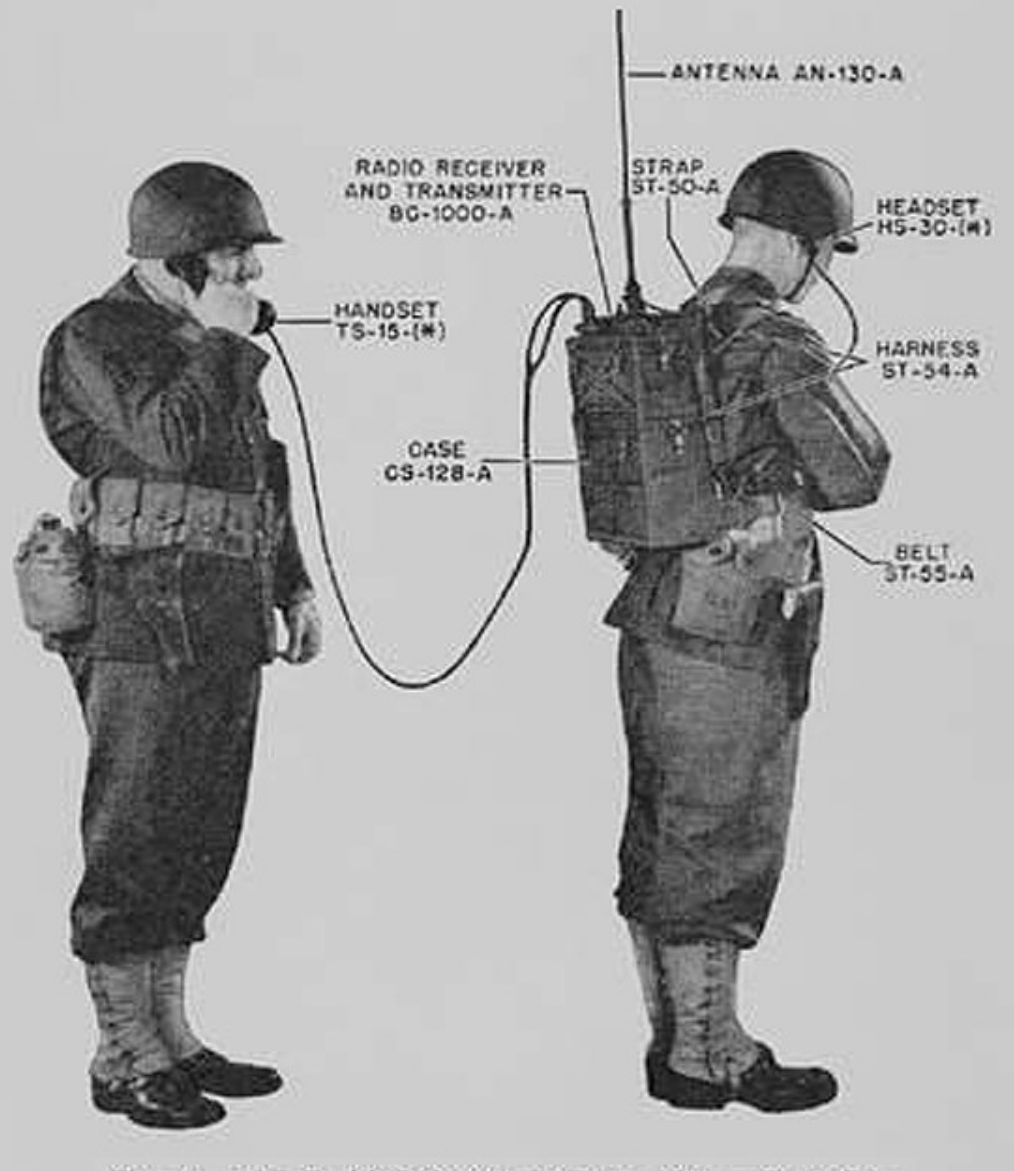
Figure 1. Radio Set SCR-300-A. In Use, Viewed From Right Side,